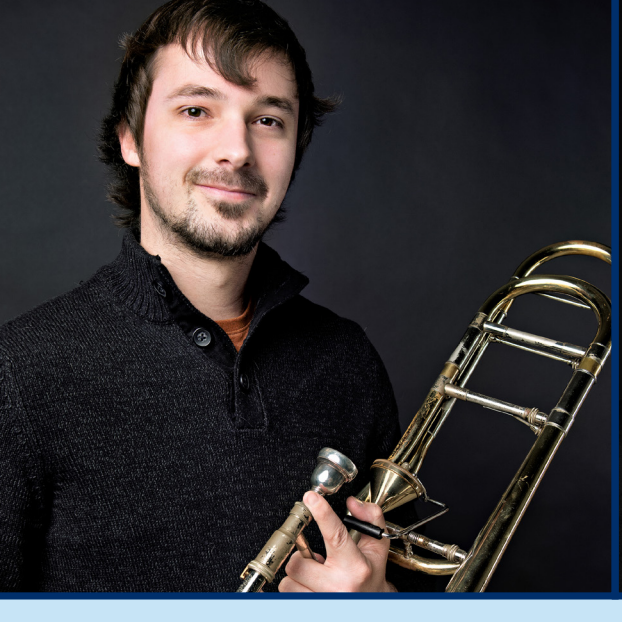
Faculty Recital March 1 • 4 p.m.