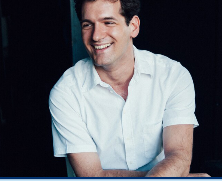
Art of Listening November 3 • 4 p.m.